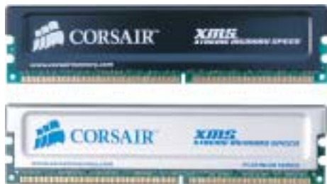
Single Channel vs. Dual Channel (Performance on Asus P4C800 using common benchmarks)